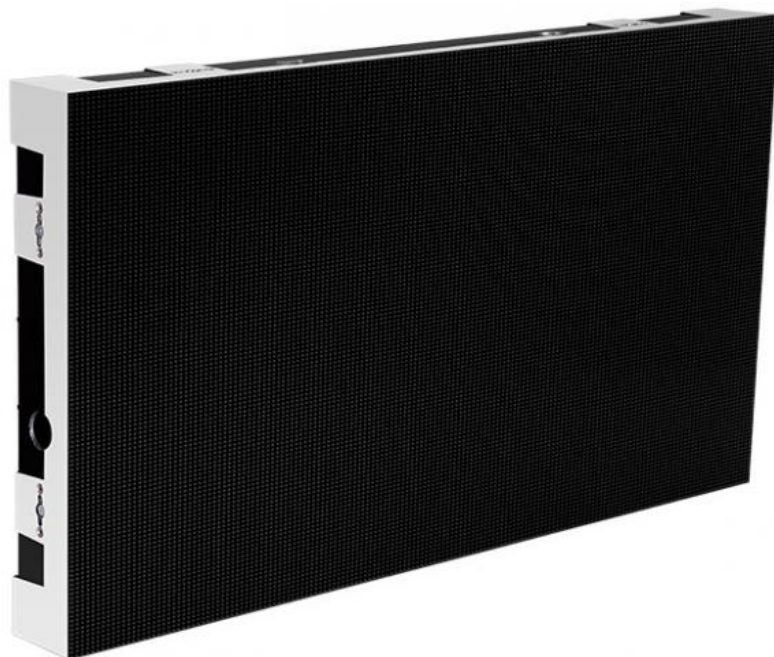
Small Pixel Pitch Indoor Full color LED Display Specification